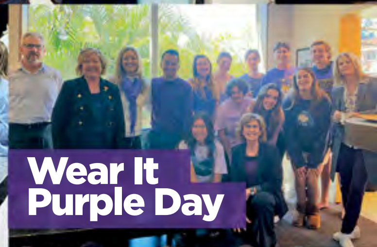
Wear It Purple Day