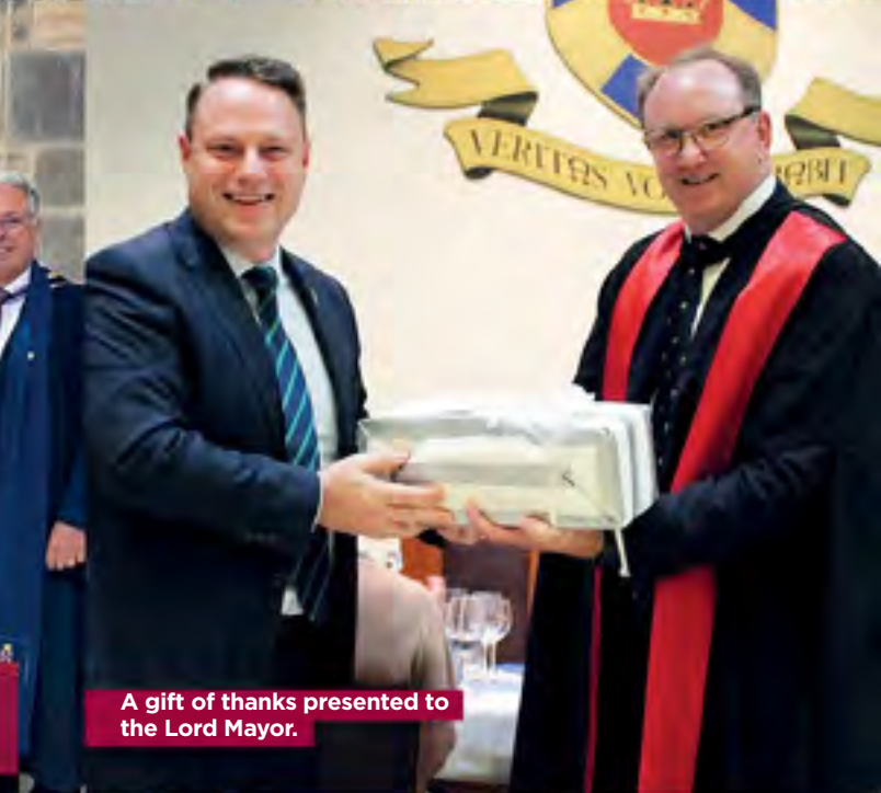
A gift of thanks presented to the Lord Mayor.