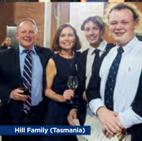
Hill Family (Tasmania)