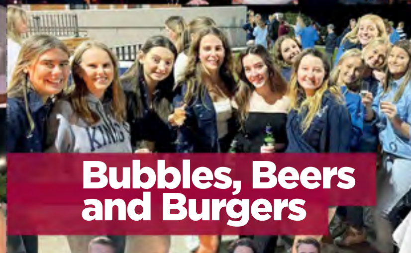
Bubbles, Beers and Burgers