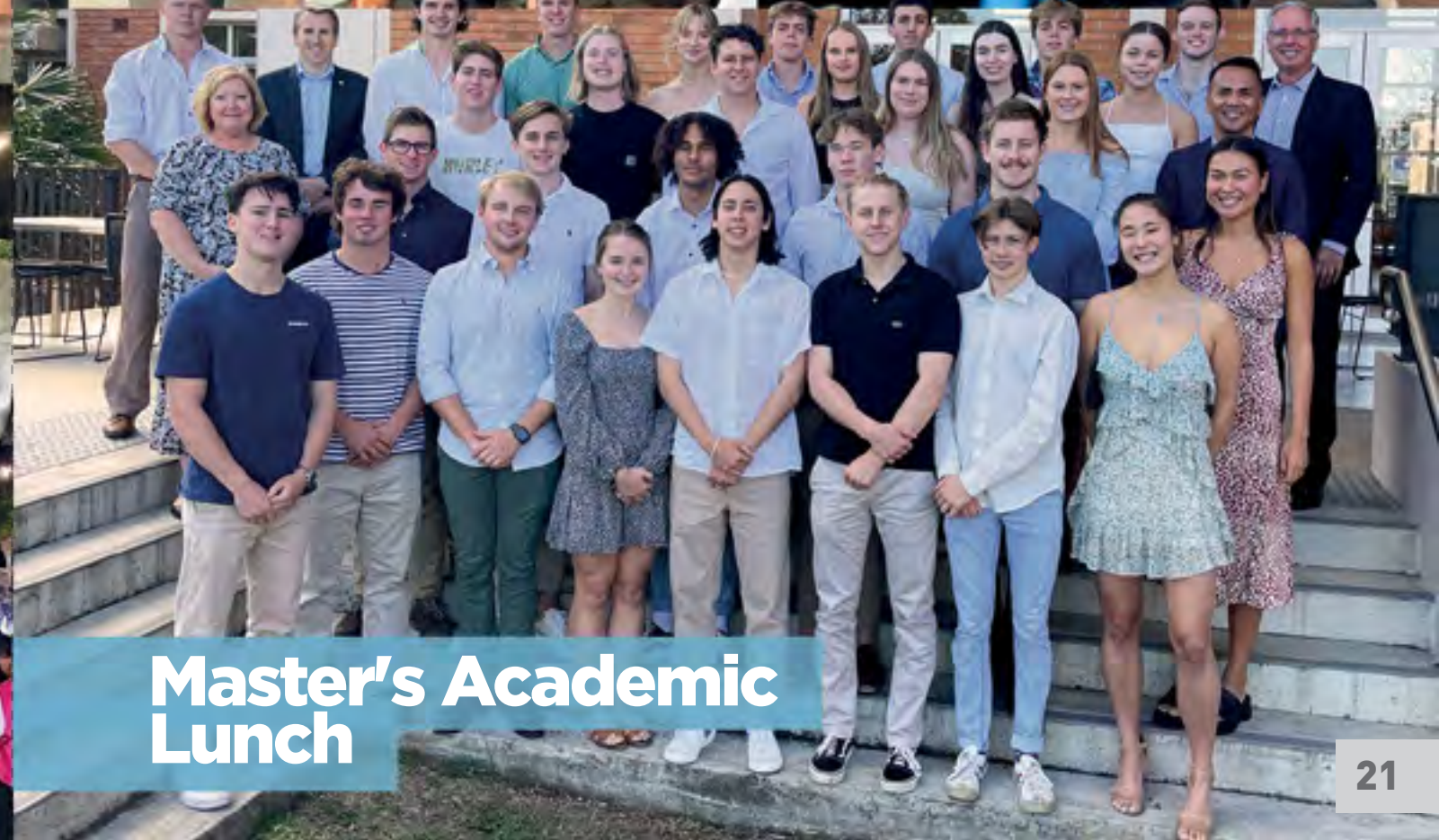
Master's Academic Lunch