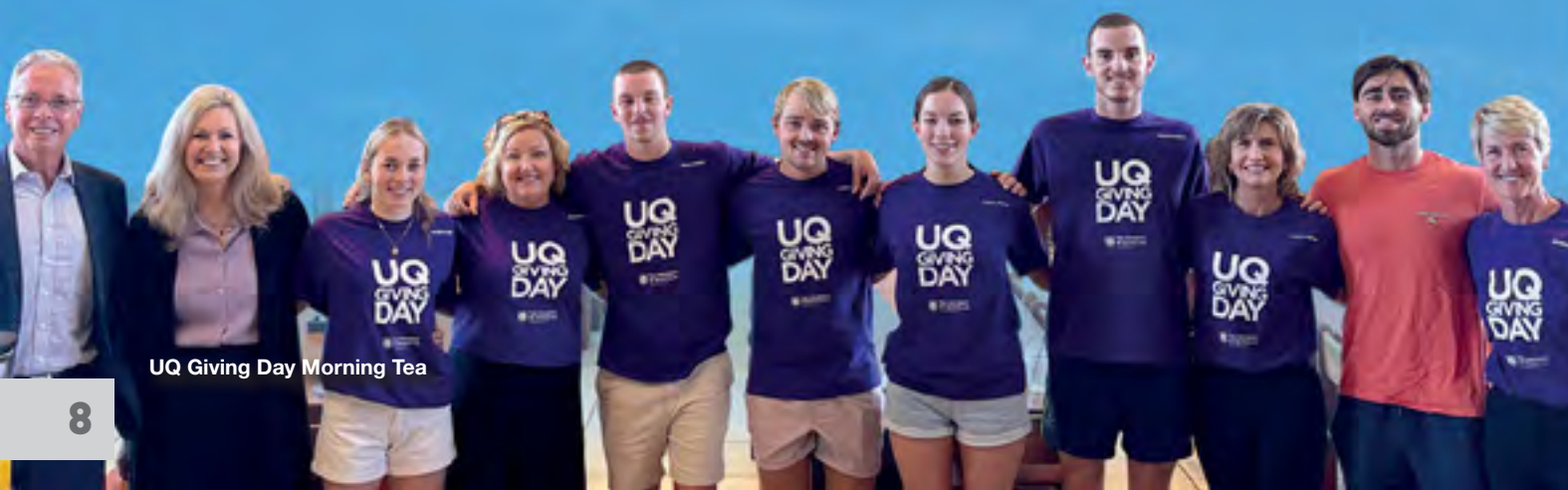
UQ Giving Day Morning Tea