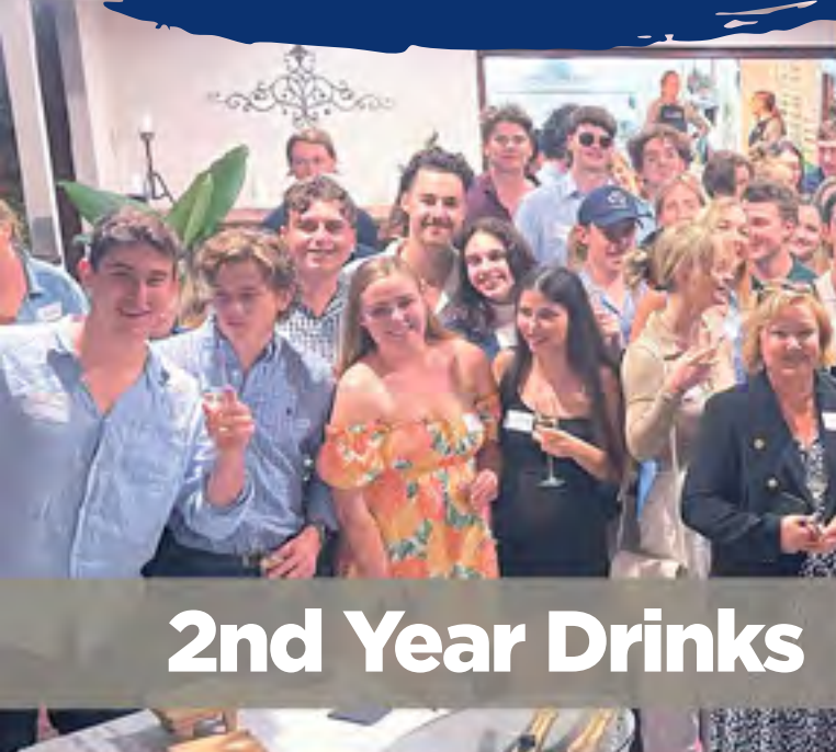
2nd Year Drinks