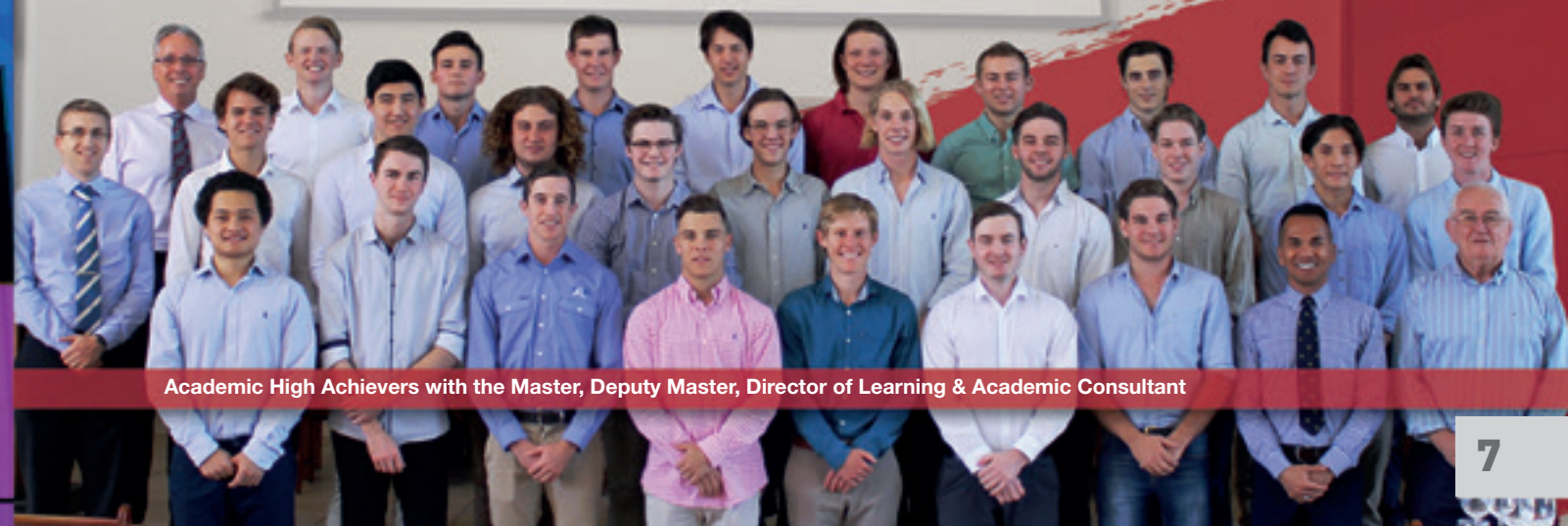
Academic High Achievers with the Master, Deputy Master, Director of Learning & Academic Consultant

Personalised business cards were introduced for third and fourth year students, proving to be a valuable tool when networking.